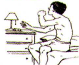
Wake up at Night